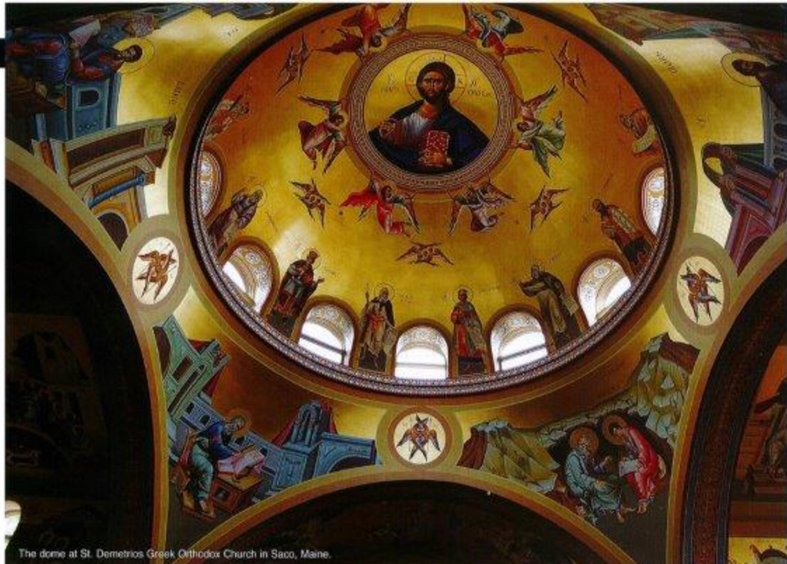
The dome at St. Demetrios Greek Orthodox Church in Saco, Maine.

fair award for Byzantine architecture for his demonstration of how to place a round dome on a square base, confirmed his calling and launched his career and life-long devotion to design for the Orthodox faith throughout America.